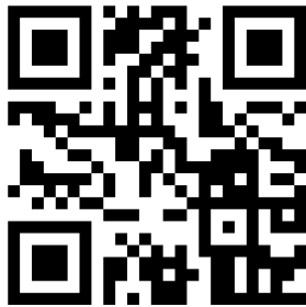
DOWNLOAD TruEL Wire Connection Guide

TruEL™ Wire has a wide range of brightness possibilities, making this product so exciting. Typically, EL Wire brightness ranges from 75-150cd/m, which looks great at night but gets washed out during the day. TruEL™ Wire can support higher voltages and frequencies when comparing to common EL Wire so a vast amount of brightness potential has just been unlocked. Below is a quick graph to illustrate how voltage plays in with the overall lifespan of the product. In short, the lower the frequency, the longer the lifespan of the product becomes. However, an easy way to increase the brightness of the product is to increase the frequency. This in turn lets you achieve brightness levels up to 1000cd/m, but the sacrifice is lifespan of the product. In some instances, like stage performances or parades, a shortened lifespan is a sufficient trade-off for increased brightness.