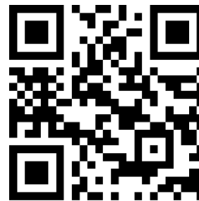
Watch Instructional Video